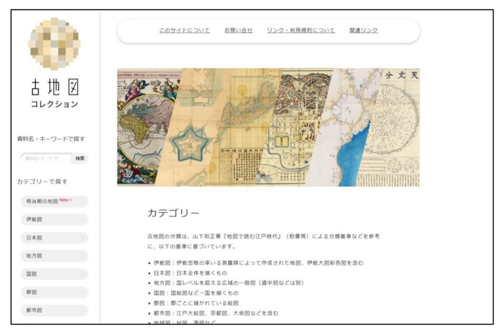
Figure 1. Screen of "Old Map Collection".

2018 marked the 150th anniversary since the beginning of Meiji period, when the modernization of Japan started. In order to bequeath the history of Meiji to future generations, Japanese government has promoted the policy named "MEIJI 150th". One of the projects GSI conducted related to "MEIJI 150th" was the additional release of 1:20,000 scale original rapid survey map, e.g., Figure 2, on "Old Map Collection". This map was created from 1880 to 1886 (the 13th -19th years of Meiji period) in advance of the national survey by General Staff Office of the Imperial Japanese Army, and is now owned only by GSI. It contains 921 colored map sheets which cover the area of capital Tokyo and its surrounding regions.