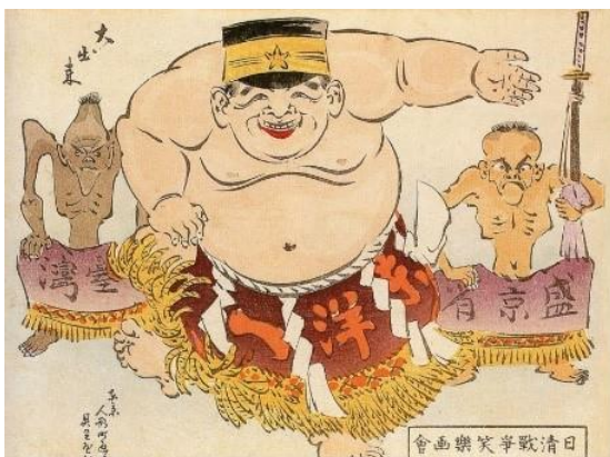
Figure 1. :Full of sarcastic cartoon map