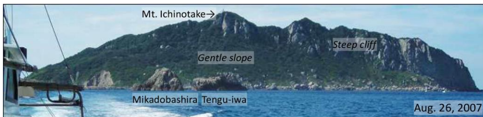
Figure 1. Landscape of Okinoshima island from the south.

The Sacred Island of Okinoshima and Associated Sites in the Munakata Region was registered as a World Heritage in July 2017. Okinoshima island is located about 70 km northwest of Kyushu main island. The island consists of a steep cliff and gentle slope and the area of the plain is small. It consists of shale, quartz porphyry, and talus deposit.