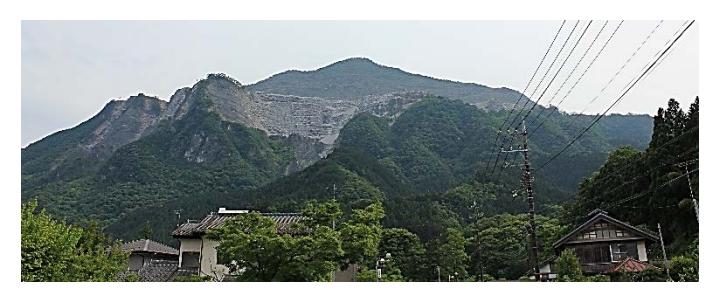
Figure 2. Mount Bukō.