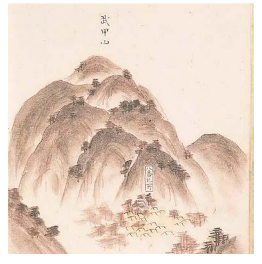
Figure 3. Drawing of Mount Bukō in Edo period. Takemura Ritsugi (1823) Chichibu-Junpaiki .