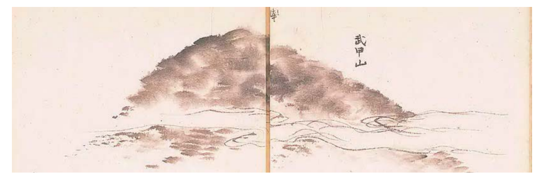
Figure 4. Drawing of Mount Bukō in Edo period.