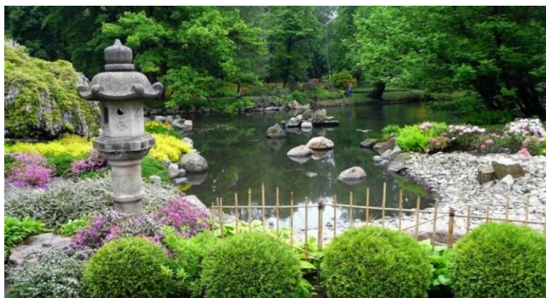
e) Japanese style