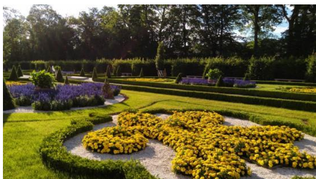
c) Baroque style;