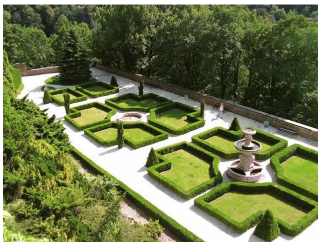
a) Renaissance style;