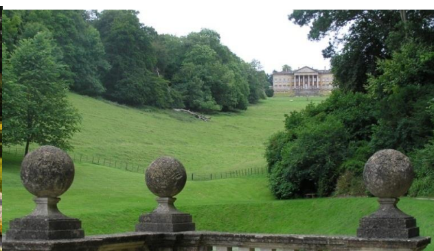
d) English style