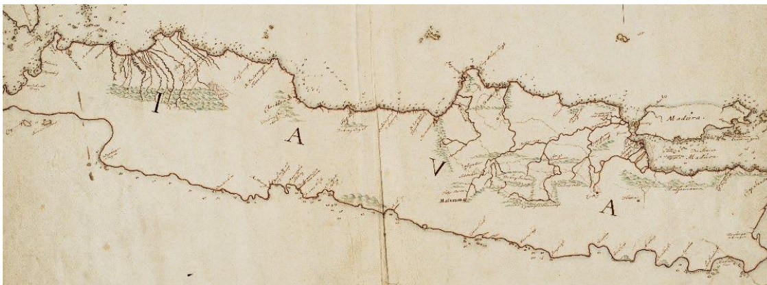
Figures 2 and 3 Java as portrayed in 1709 (above) and 1760 (below).

Comparison of the contents of the two atlases suggests changes in the focus of mercantile operations of the VOC, as there is less interest for the African coast and for Kerala in the De Haan atlas, and more for the Philippines and Eastern Indonesia. Neither atlas shows any maps for Borneo, apparently this large island did not present any opportunity for trading. Although Australia did not present any commercial interest either, its western coasts were extensively portrayed in both atlases. Of course, comparison of the two atlases also shows the advances in geographical knowledge of Southeast-Asia. An example is shown in figures 2 and 3 for the isle of Java.