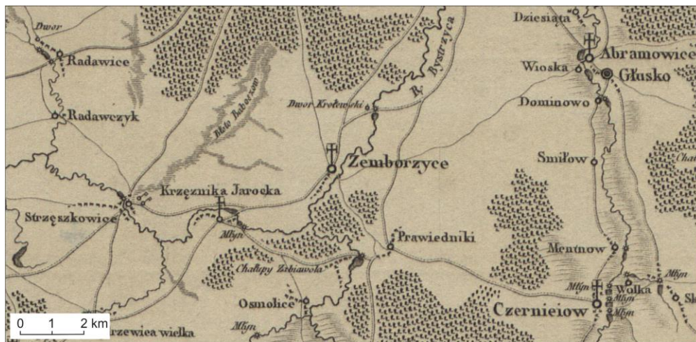
Figure 1. Fragment of the map covering Zemborzyce parish near Lublin (currently eastern Poland).

Charles Perthées, who was a leading cartographer of King Stanisław August Poniatowski at the dawn of the Polish–Lithuanian Commonwealth, elaborated maps of palatinates (1:225,000, 1783–1804). They form a first map series of the Crown covering this area with the full settlement network, administrative borders, and natural environment. These maps were drawn with almost no field measurements or triangulation but on the basis of textual descriptions prepared by the parsons from 1778 to 1785. The form of the maps is, however, similar to medium-scale topographic maps. Although the planimetric precision is much lower than on Austrian or Prussian maps of these times, Perthées’ maps are much in detail (Fig. 1). For 21 years Perthées managed to elaborate 12 maps for 11 palatinates of the Crown after the First Partition. The maps serve as a primary source of information for settlement network reconstruction of the end of the 18th century and are extremely valuable for historians and geographers (Buczec 1966). The aim of the paper is to describe the idea behind their digital edition: digital representation of the maps and their content.