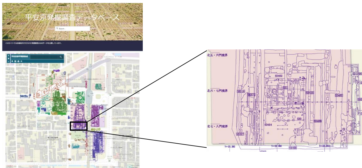
Figure 1. Platform (beta version) using ArcGIS Hub for releasing the Heian-kyo site's database (left) and enlarged plan view (right).

Furthermore, we display the locations of the excavations from the Heian-kyo site's database as points on the maps for every decade for the 1970s, 1980s, and 1990s (Figure 2). Here, the maps also show the distribution density by Kernel density estimation and the Heian-kyo's square-grid pattern. In these three periods, Heian-kyu (the Heian Imperial Palace), located north of the center of the Heian-kyo site, has a particularly large number of excavations. Heian-kyu was not only the imperial residence but also where state ceremonies were held, and since the Kyoto City recognizes this area as an important archaeological site, it conducted many excavations. In the 1970s, many excavation sites were lined up in a straight line along Karasuma Street. This is a result of a series of excavations associated with the city's subway construction, and clearly shows that these sites were selected due to social factors, namely urban development. Although the sites were destroyed by the construction, the survey results of the excavations under the subway running north-south at the Heian-kyo site were of great use in archaeology. Interpreting these sites from a social perspective and examining the excavation results and the ways in which the sites were treated will give us an important perspective for future site management and research.