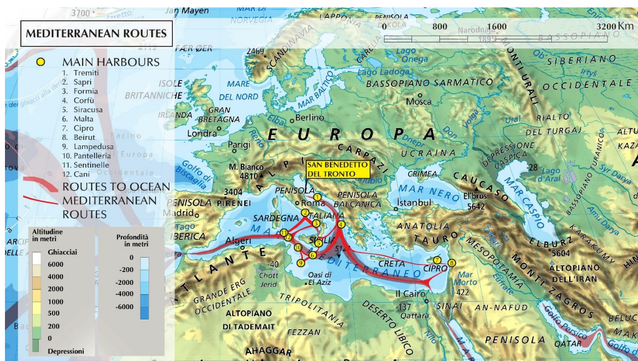
Figure 2. Map of main routes within Mediterranean sea