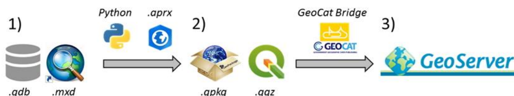
Figure 1. Transformation of the KM500. 1–2) The .gdb and .mxd are converted to .gpkg and .qgz including styles via Python-Script (schema-transformation) and ArcGIS Pro + QGIS-Plugins (stylings). 2–3) From the .gpkg and the .qgz SLD-Files are generated for usage in GeoServer.

An overview of the visualised GeoPackage in QGIS is given in Figure 2. No significant differences between the KM500 maintained as .gdb/.mxd or .gpkg/.qgz can be seen after the conversion. The presentation will summarize the aims of the project, the most important transformation steps and will give an outlook to the migration of the other Cartographic Models (KM250, KM50).