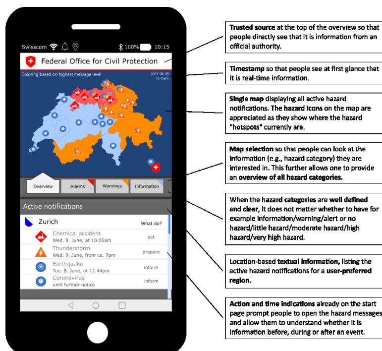
Figure 2. Evidence-based recommendations for the design of event-related overviews on multi-hazard platforms, from (Dallo, 2022).