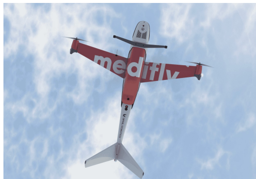
Figure 1. Medifly-Drone. © Aerial Robotics.

In the Medifly research project, test flights of drones are being carried out to transport medical goods in Hamburg. When time-critical tissue samples or medicines have to be transported from a hospital to a laboratory, the use of drones should save time and thus improve medical care. Part of the project is a participation process whose goal it is to measure and increase the societal acceptance of Urban Air Mobility (UAM) (Fraske et al. 2021) and to increase the transparency of the route planning process. In this paper we describe the participation tool U_CODE - Urban Collective Design Environment in the use case Medifly, with which users can plan routes themselves by regarding the real restrictions. We will integrate the planning reality in our geovisualization to inform the users about the drone routes restrictions in a more understandable way in the city in terms of avoidance of larger crowds, mostly public amenities such as schools and parks or avoidance of taller buildings, distance to air traffic or distance from infrastructure such as big streets. Finally, to measure the societal acceptance of citizens we will analyse the collected data through the participation tool. To conclude, the digital participation tool can provide more acceptance and increase transparency by route planning of Medifly drones (Figure 1) to improve medical care and urban health for the future.