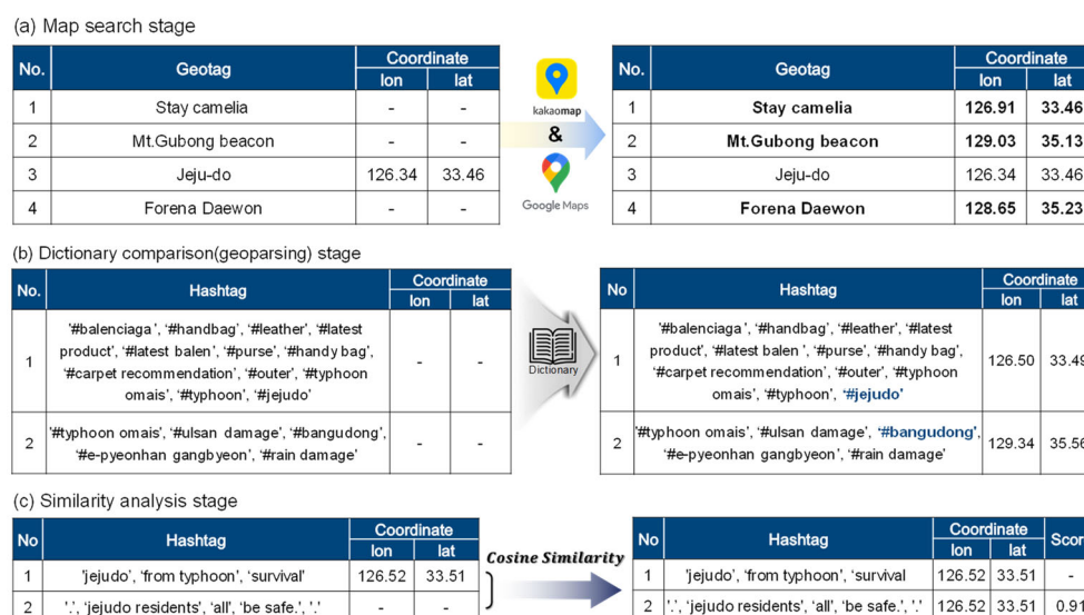
Figure 1. Procedure of proposed Geocoder method

This study proposed a spatiotemporal method to utilize social media data for identifying disaster damages. Most of the social media data are not geotagged, and some geotags are just toponym entered by the author and do not contain any coordinates. Considering these characteristics of social media data, the proposed method (geocoder) proceeds in three stages (Fig. 1). As shown in Fig. 1(a), in a map search stage, API and crawler are used to give a coordinate to posts that have geotag but have not been coordinated. In this stage, geotagged data that contain coordinates will be ignored. In a dictionary comparison (geoparsing) stage, a gazetteer consisting of district names and Points of Interest (POI) of the South Korea is used. For example, in Fig. 1(b), the hashtags are compared with place names in the dictionary, and the coordinate of the most matched place name is used. In a similarity analysis stage, posts are compared with each other by a sentence similarity analysis method. As shown in Fig. 1(c), the coordinate of the post with the highest sentence similarity is used. This process is carried out for spatial informatization of non-geotagged data.