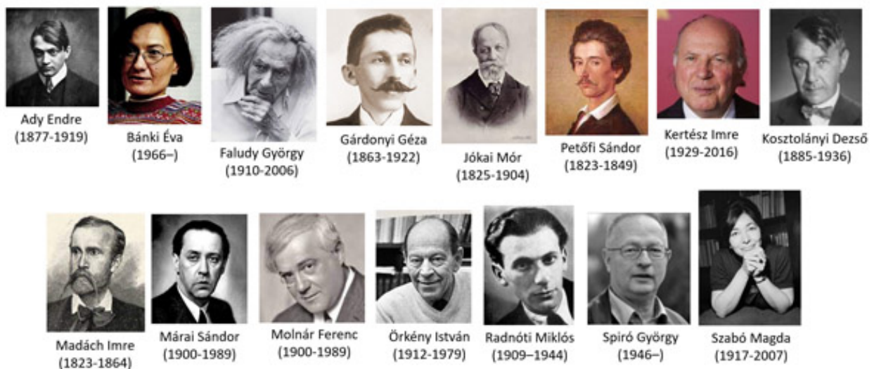
Figure 1. Hungarian writers and poets selected for the online map library.

The main aim of this project was the creation of an online map library of writers and poets of the participating countries that can be freely accessed on the web. The two main tasks to be filled by the online map library are giving an illustrated, multimedia biography of each writer and poet, as well as an introduction to their literary works with emphasis on those that are taught in secondary schools.